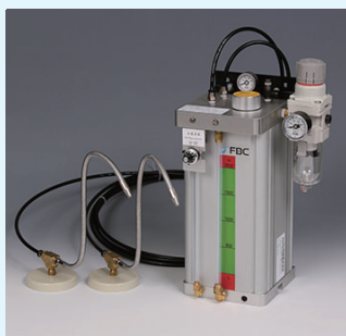
MK (air filter regulator equipped)

(※3)Outlet Valve offers mist come out rapidly to keep pressure in the tank constant.